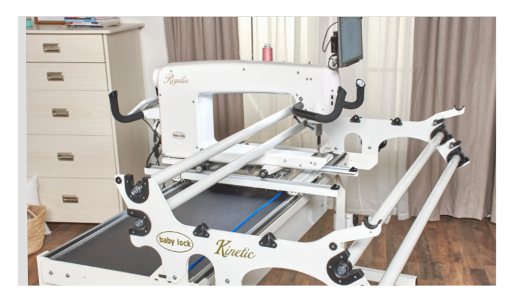
Carriage/Flexirack System The Carriage/Flexirack System is easy to install and allows motors to disengage for free-motion quilting.

The Pro-Stitcher system operates from a single 12" (30mm) color touchscreen tablet that mounts onto a stitch-regulated quilting machine, giving you full, real-time control over every inch of your design work. (*Regalia, Coronet and Crown Jewel models)