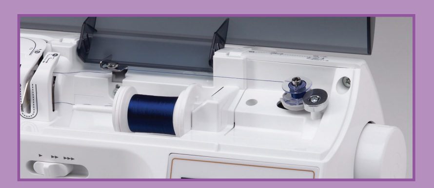
Quick-Set Bobbin Winder The Melody takes all of the hassle out of sewing – including winding your bobbins! The winder seat holds the thread in place and stops automatically when the bobbin is full.

Avoid the struggle of changing your bobbin with the Quick-Set feature. Simply drop your bobbin in the machine, pull your threads through the slot, and let your machine do the rest of the work.