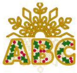
CT1: Christmas Designs