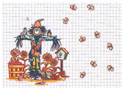
illustration. To print a template, select the Print Preview on the top toolbar. Select Settings; place a checkmark next to Print Actual Size field, Print Color Analysis. Click on OK. Select Print to create a template for perfect placement of the design on your garment. Save the design giving the design a name.

Click on the Select icon and left click on the bugs. Move the bugs to the right of the scarecrow. To duplicate two more sets, right click on the bugs and select Copy, and then Paste. Repeat to create the third set. Move the bugs into position as shown in the